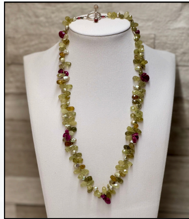
DESIGNS BY MAGZ