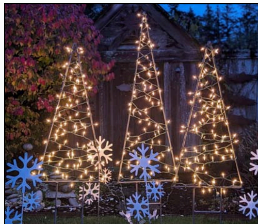
Artist: Bayside Treasures