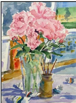
Artist: Lyn Rackley (donation)