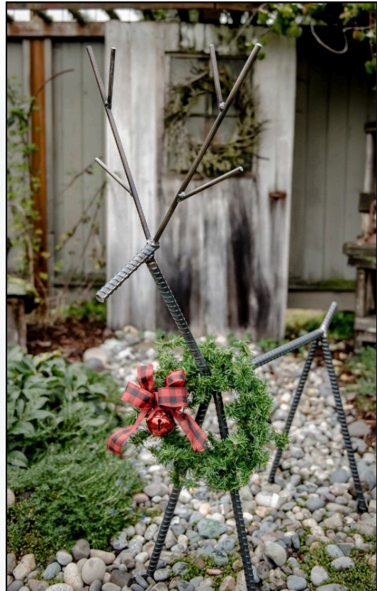
Artist: Bayside Treasures