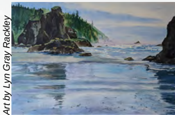
Art by Lyn Gray Rackley